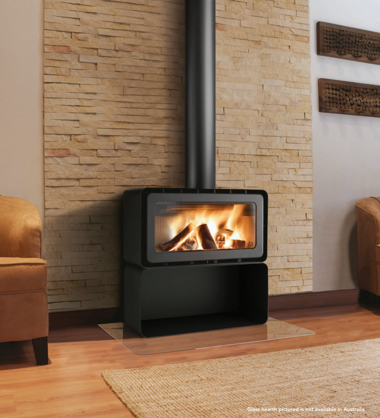
Glass hearth pictured is not available in Australia

* Depth includes a min. 650mm in front of the unit.