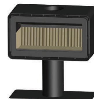
Hayra 85P Freestanding Pedestal