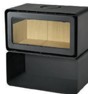
Hayra 85L Freestanding includes base (optional fan)